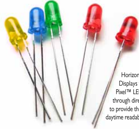
Horizon Electronic Displays with Smart Pixel™ LEDs cut through direct sunlight to provide the brightest daytime readability.