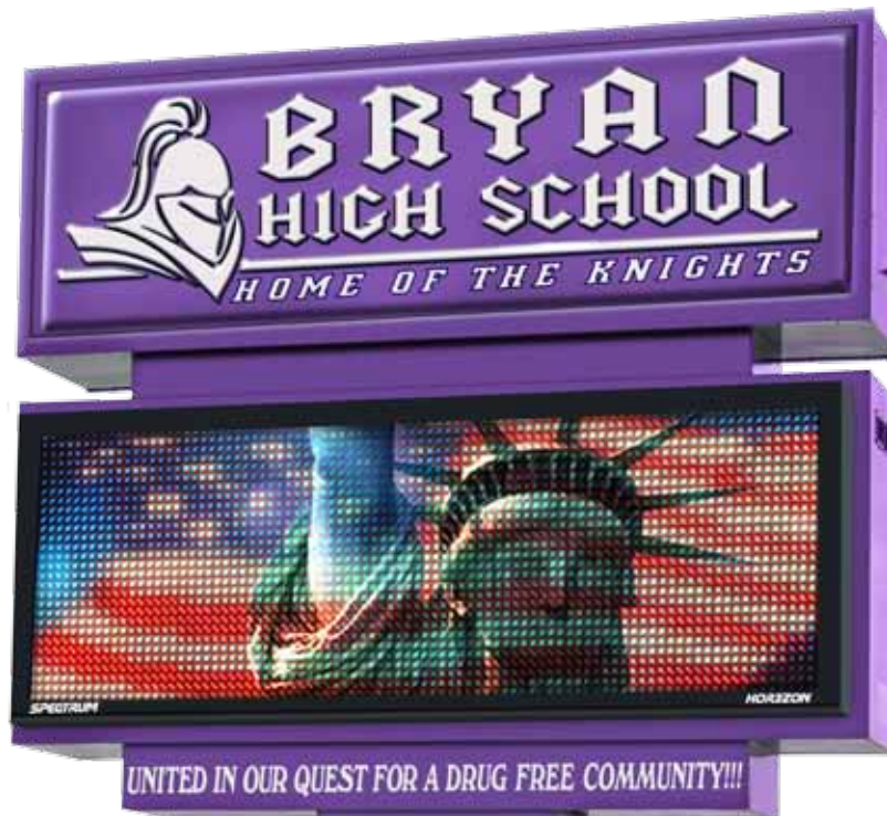
Horizon Electronic Displays with Smart Pixel™ LED technology provides the clarity and performance you need in bright vibrant colors.